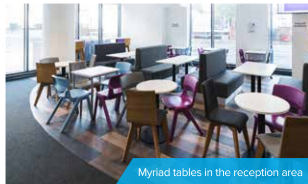
Myriad tables in the reception area