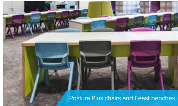
Postura Plus chairs and Feast benches