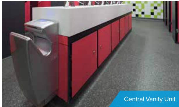
Central Vanity Unit