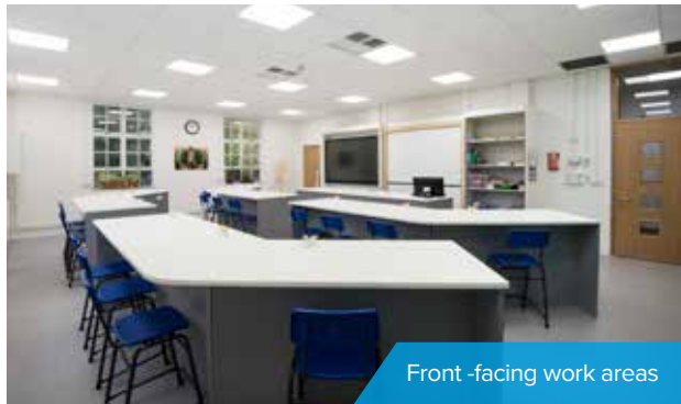
Front-facing work areas

The overall area equated to 3,200 square feet and consisted of 7 science laboratories, 2 prep rooms and 2 corridors. In 4 of the science laboratories and 1 prep room we stripped out and fully refurbished the rooms using science Capacity Storage furniture. In 2 additional labs we supplied and installed Velstone worktops and for the remaining science lab and prep room we supplied new furniture. TeacherWalls were supplied in most of the science laboratories accommodating smart boards and traditional rollerboards.