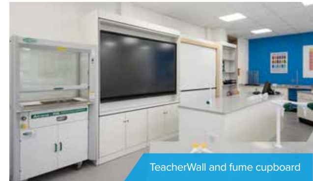
TeacherWall and fume cupboard