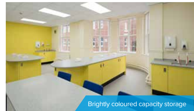
Brightly coloured capacity storage