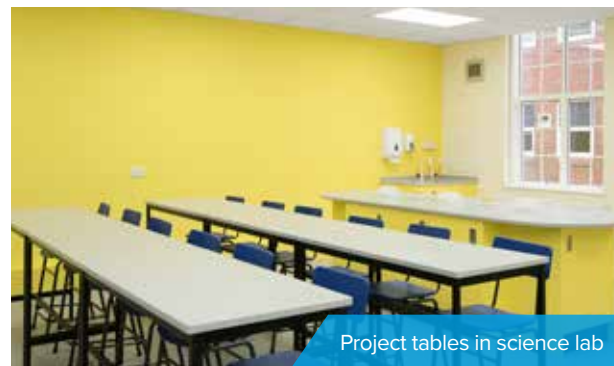
Project tables in science lab