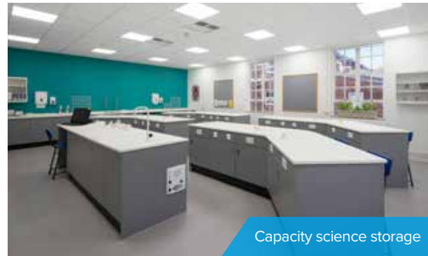
Capacity science storage