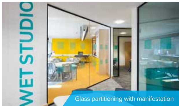
Glass partitioning with manifestation

For the teacher-led areas, we installed colourful TeacherWalls with sliding dry wipe panels, TVs, pull-out laptop drawers and multiple storage elements. Pinnacle fitted track hung movable wall panel systems which had a mixture of dry wipe and pin board surfaces. Throughout the space, we fitted glass partitioning with manifestation and graphics along the walls to distinguish each area, and in the Brainstorm Room, we provided tiered seating upholstered in a bold turquoise fabric with built-in storage boxes.