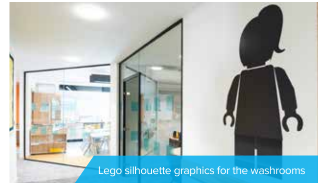
Lego silhouette graphics for the washrooms