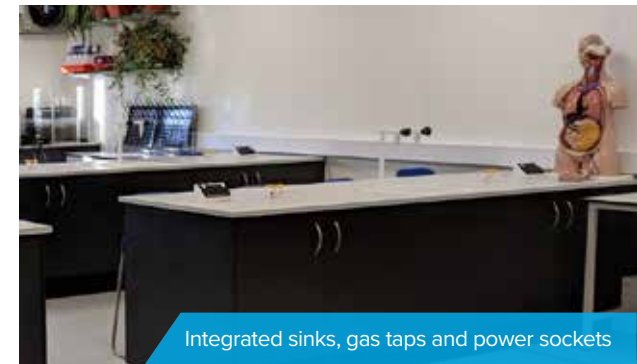
Integrated sinks, gas taps and power sockets