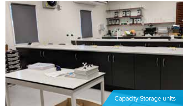
Capacity Storage units