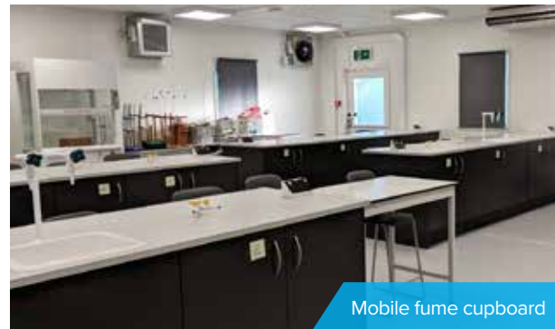
Mobile fume cupboard