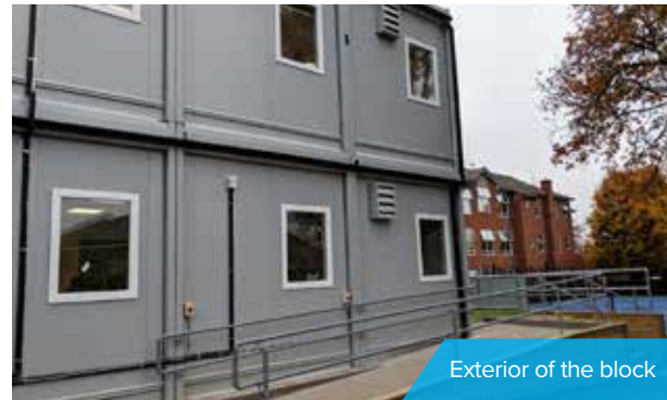
Exterior of the block