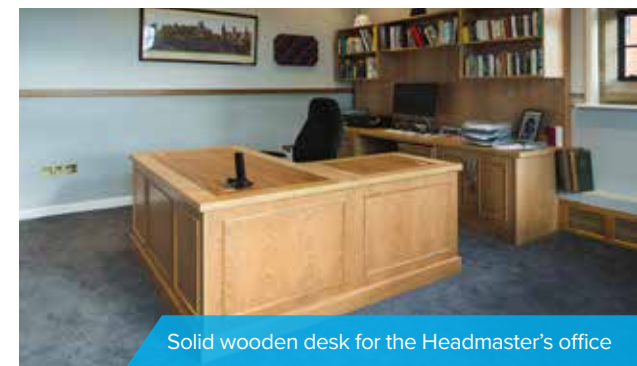
Solid wooden desk for the Headmaster's office