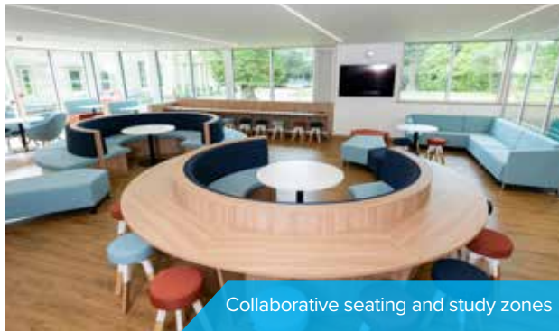
Collaborative seating and study zones

To create both a practical and creative learning space for students and staff, we fitted Teacherwalls in the classrooms to provide adaptable teaching and maximise storage facilities. Ergoflex chairs were supplied to provide both ergonomic and longlasting support. In the main space, tailored Sculpt and Penta seating created colourful zones to break up the large area and provide everyday comfort.