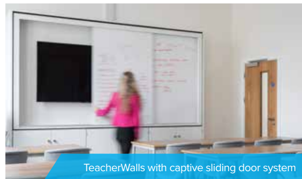
TeacherWalls with captive sliding door system