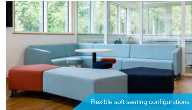
Flexible soft seating configurations